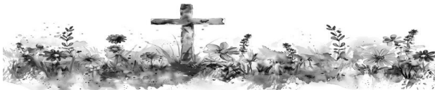
The flowers on the altar are for Jesus With Love

The Lord took "some of the Spirit" that was on Moses "and put it on the seventy elders" of Israel (Num. 11:25), and they "prophesied in the camp" (Num. 11:26). In the same way, our risen Lord Jesus poured out His Holy Spirit at the Feast of Pentecost — the 50th day and the "Eighth Sunday" of Easter. When "a sound like a mighty rushing wind" and "tongues as of fire appeared" and rested on each of the 12 apostles, "they were all filled with the Holy Spirit" and proclaimed "the mighty works of God" (Acts 2:2-4, 11). The Lord Jesus grants this same Spirit to His Church on earth to proclaim Him glorified on the cross and risen victorious from the grave for us sinners. From His open heart, our crucified and risen Lord pours out His Holy Spirit in "rivers of living water" (John 7:38) and invites everyone who thirsts to come to Him and drink freely (John 7:37). Through this life-giving work of the Holy Spirit, we hear our pastors "telling in our own tongues the mighty works of God" (Acts 2:11), and "everyone who calls upon the name of the Lord shall be saved" (Acts 2:21).