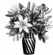
The flowers on the altar are from Ladies Guild.